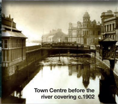
Town Centre before the river covering c.1902