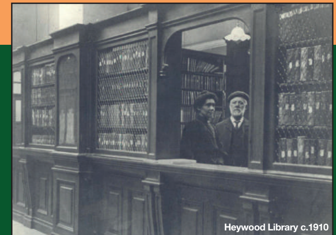
Heywood Library c.1910