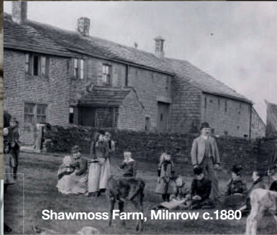
Shawmoss Farm, Milnrow c.1880