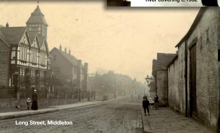
Long Street, Middleton