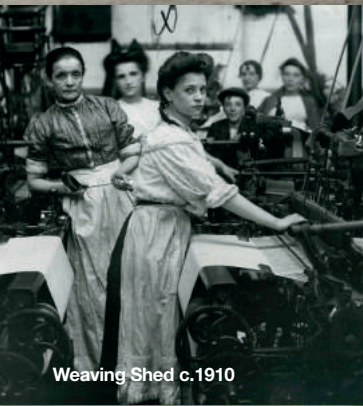
Weaving Shed c.1910