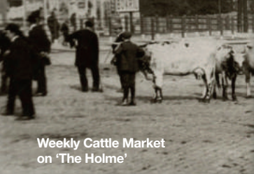
Weekly Cattle Market on 'The Holme'

For further information on Middleton and Heywood ring 0300 3038876 or email library.service@rochdale.gov.uk